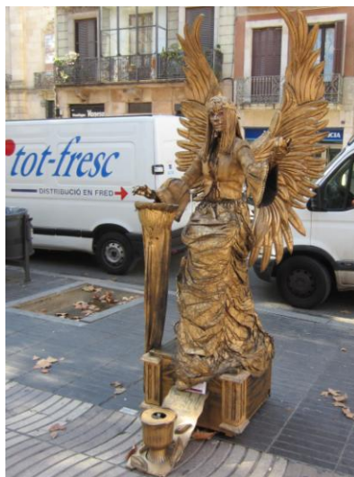
A human statue performs in La Rambla.

Monstrous bodies also form a part of imagined, mythical origins in the city, periodically re-emerging in cultural celebration such as the strange correfoc devils or the vibrant parades of gegants i capgrossos . 10 This self-recognition or mirroring of the monstrous body also takes place during the performance of the play as the form and presence of the actors, their assemblages and sculpture can be seen to express, not only a continuing relation to their previous stage appearances 11 , but also to an imagined shared cultural history. Thus, the visibility of the bodies performing on stage brings about locally inscribed meanings and memories. These can be seen as 'body doubles, overexposed on the surface, everywhere visible and in