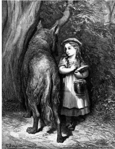
Illustration by Gustave Dore (1832– 1883)

succeeded by other, often male-narrated conservative retellings (including the Brothers Grimm version in 1812) that fail to problematise myths about rape, but rather as cultural theorist Jack Zipes notes ‘they make women willing participants in their own defeat, obscure the true nature of rape by implying women want to be raped and assert the supreme rightness of male power either as offender or protector’ (1993, 325). This inscription of patriarchal values has been further heightened by the early illustrations of the story: ‘the girl in the encounter with the Wolf gazes but really does not gaze, for she is the image of male desire’ (Zipes in Day, 1998, 148).